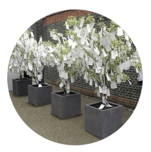
photo of tree with meACTIVITY TIME: 1-2 hours | SKILL LEVEL: Easy | COSTS ESTIMATE: $$